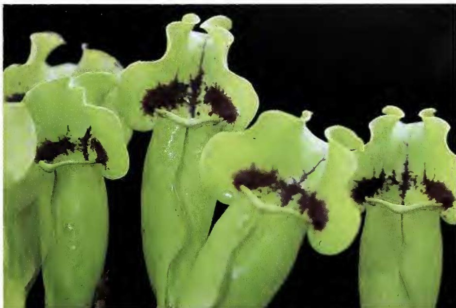
Figure 3: Sarracenia 'Sorrow'.